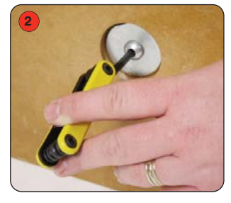
Tighten to 50mm round posts