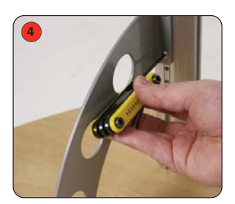
Attach curved leg to base and round posts