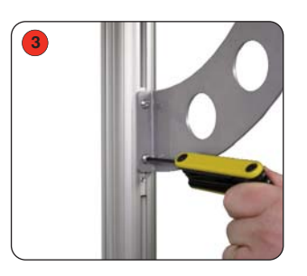
Attach shelf to 50mm post (please note that the shelf must be attached before the LCD mount)