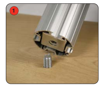
Insert screw through penny washer and base