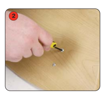
Attach supports to shelf