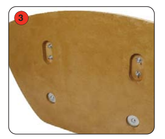
Fix all screws to round posts through base