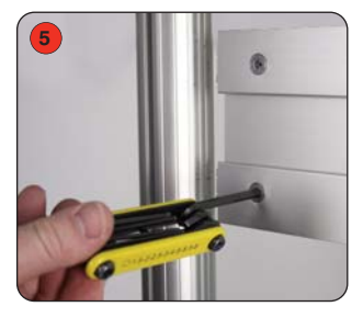
Attach and tighten support strut between round posts