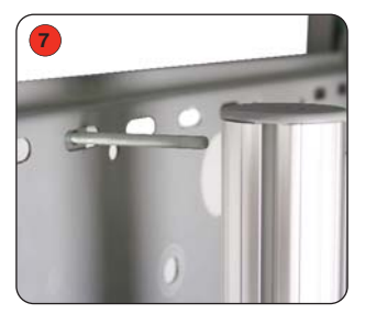
Attach LCD mount to 50mm round posts with M6 x 70mm screws, flat washers, spring washers, and thumb wheels.