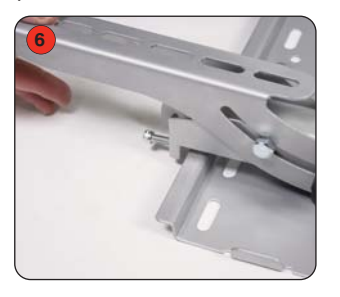
Attach LCD brackets to LCD bracket backboard.