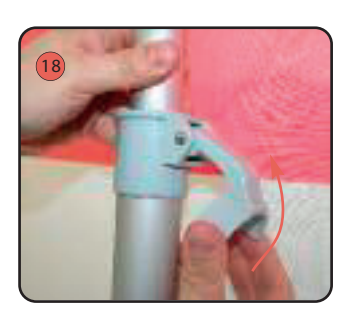
Unlock one telescopic support pole and raise up the graphics to the desired height.

Space out evenly. For double sided display repeat steps 14 to 17 for the 2nd graphic