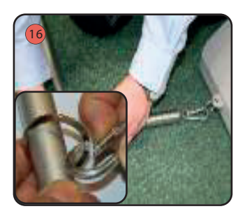
Attach the other end of the base spring to the bottom bungee pole metal ring.