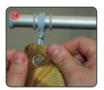
Take the top horizontal edge of the graphic and attach each eyelet onto the plastic hooks on the top bungee pole. Space out evenly.