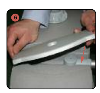
Refit the 4 base covers.