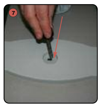
Fasten the 4 base screws to secure.