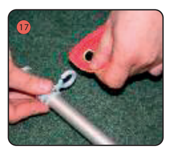
Take the bottom horizontal edge of the graphic and attach each eyelet onto the plastic hooks on the bottom bungee pole.

Space out evenly. For double sided display repeat steps 14 to 17 for the 2nd graphic