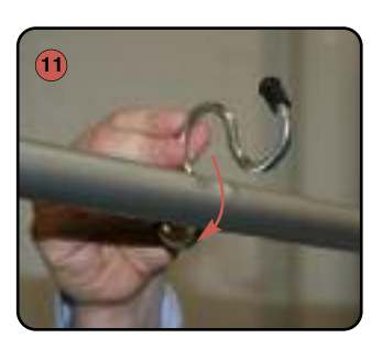
Place the 2 graphic support hooks over the top support pole.