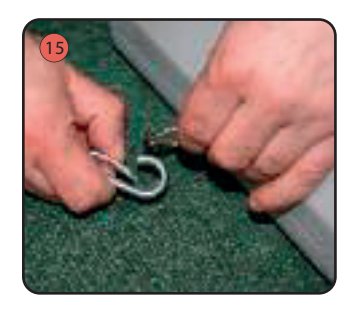
Attach the base springs to each base tank ring.