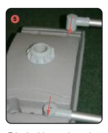
Take the 2 base poles and slot into each base tank. Repeat for the 2nd tank.