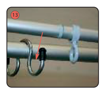
Rest the top bungee pole (pole WITHOUT metal rings) onto each support hook.