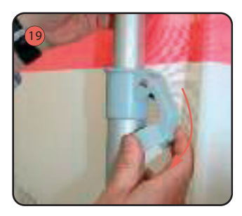
Lock the telescopic support pole into place. Repeat for the 2nd support pole.