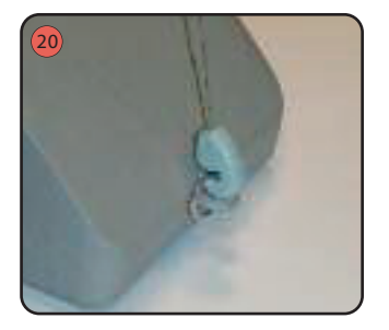
Attach wire from vertical pole to metal ring on water base