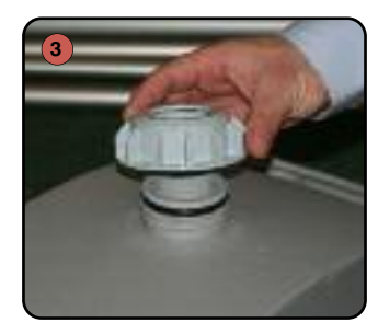
Un-fasten the base screws from the base tank.