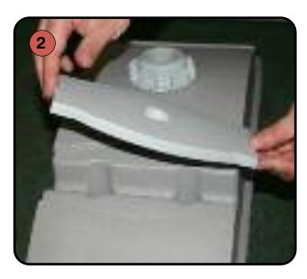
Lift off the 4 base covers and put to one side.