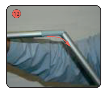
Assemble 1 top bungee pole and 1 bottom bungee pole.