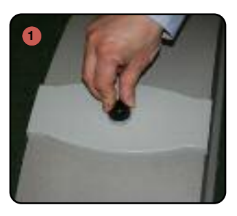
Unscrew the 4 base screws from the base tanks and put to one side.