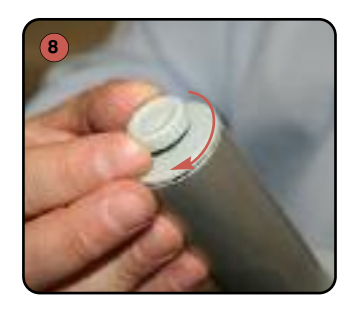
Unfasten the screw from the top of each telescopic support pole and put to one side.