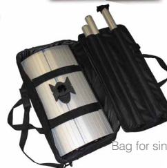
Bag for single units

Magnetic graphic joining strips for a seamless graphic over multiple panels.