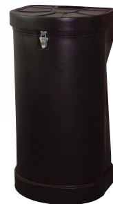
Transport case for one or two units