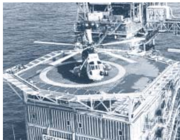
Aluminium is used in many off-shore applications, including helidecks and accommodation modules on oil rigs

(2) International Aluminium Institute in London - www.world-aluminium.org