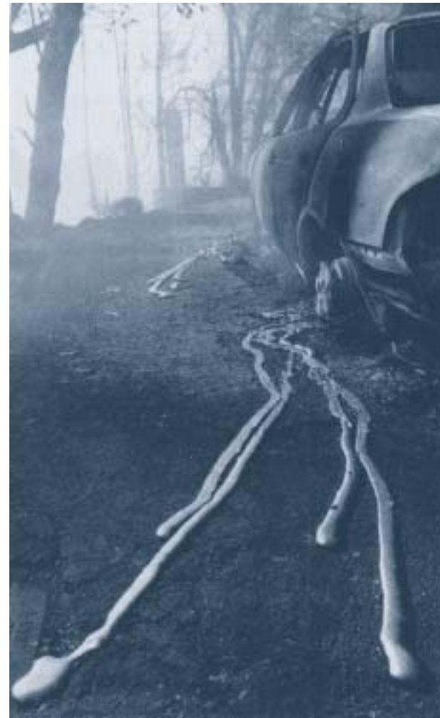
Wheels on fire: aluminium wheels melted by the inferno that ripped through San Bernadino, California, USA in October 2003.