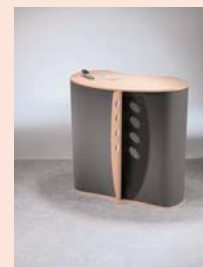
Elan Distinctive styling, Ideal workstation