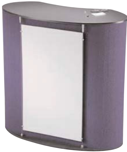
Graphic panel not included