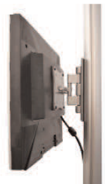
Small LCD bracket (weight 1kg approx)

Vertical position and angle of the leaflet holder can be adjusted