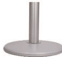
450mm dia Steel dome (weight 7.5kg approx) Recommended carry bag: LPB