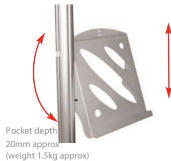
Pocket depth 20mm approx (weight 1.5kg approx)

Vertical position and angle of the leaflet holder can be adjusted