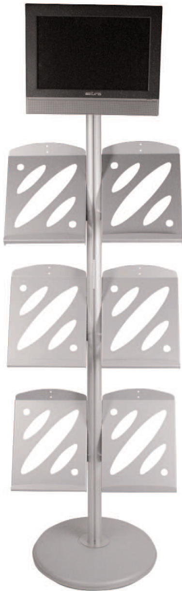
LCD Screen not supplied