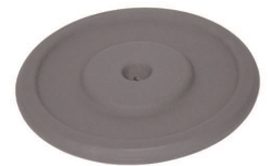
Extra weight for dome base (weight 9kg approx)