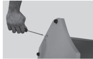
Fix the base plate to the rectangular panel using screws provided