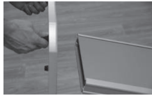
Line up the base plate holes to the main body part