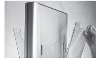
Insert the brochure holders on the rectangular panel