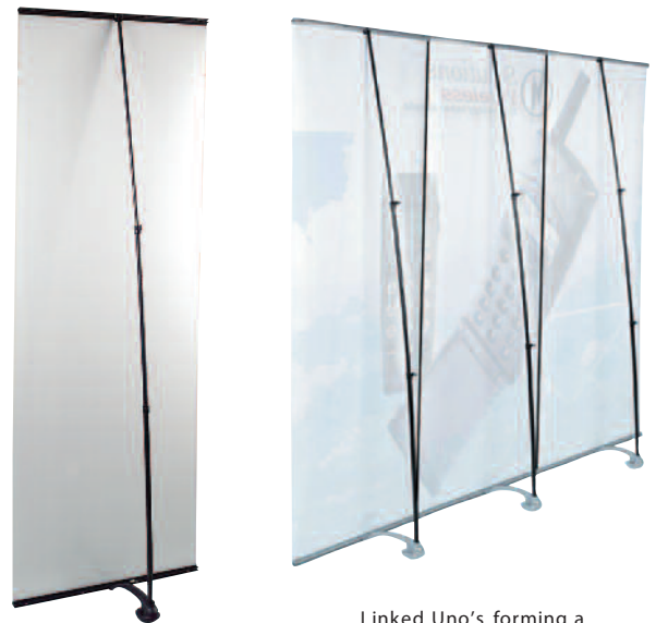
Linked Uno's forming a seamless graphic wall