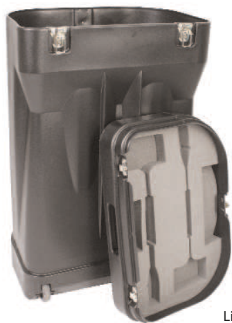
Lid with internal foam insert for lighting storage