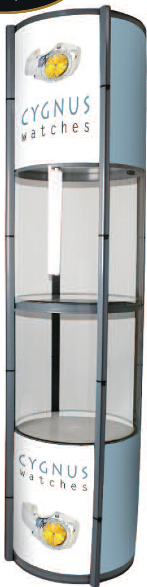
Spiral Tower (NB Graphics are not supplied)